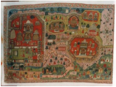
Figure 6: Calculated frequency evolution of modes detected in the BLS spectra.

In Fig. 6 the calculated frequencies of the most representative eigenmodes at +500 Oe (FM state) and − 500 Oe (AP state) are plotted as a function of the gap size d between the Py and Co sub units (please remind that in the real sample studied here, d = 35 nm). As a general comment, it can be seen that the frequencies for the system in the AP state are more sensitive to d than those of the P state. In particular, the lowest three frequency modes of the AP state (EM(Co), EM(Py) and F(Py)) are downshifted with respect to the case of isolated elements (dotted lines) and show a marked decrease with reducing d , while the two modes at higher frequencies (F(Co) and IDE(Py)) have an opposite behavior even though they exhibit a reduced amplitude. In the P state (right panel), the modes concentrated into the Py dots exhibit a moderate decrease with reducing d , while an opposite but less pronounced behavior is exhibited by the F(Co) mode.