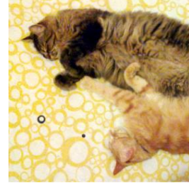
Figure 2: MFM images of the bi-component Py/Co dots for different values of the applied magnetic field which are indicated by greek letters along both the major and minor hysteresis loop.

To directly visualize the evolution of the magnetization in the Py and Co subunits of our bi-component dots during the reversal process, we performed a field-dependent MFM analysis whose main results are reported in Fig. 2. At large positive field ( H = +800 Oe, not shown here) and at remanence ( \alpha point of the hysteresis loop of Fig. 1), the structures are characterized by a strong dipolar contrast due to the stray fields emanated from both the Py and Co dots.