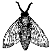
Figure 2: A sample black and white graphic that has been resized with the includegraphics command.

To set a wider table, which takes up the whole width of the page’s live area, use the environment table* to enclose the table’s contents and the table caption. As with a single-column table, this wide table will “float” to a location deemed more desirable. Immediately following this sentence is the point at which Table 2 is included in the input file; again, it is instructive to compare the placement of the table here with the table in the printed output of this document.